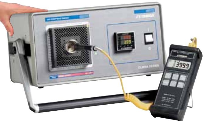
CL900A Calibrator, shown with HH-21A, handheld meter and handle thermocouple probe (both not included).

The simplest way to calibrate a temperature sensor is to check how it reads the temperature of two physical constants: the temperature at which ice melts and the boiling point of water (although the latter should be corrected for atmospheric pressure). While quick and inexpensive, one weakness of this method is that it is typically not a NIST traceable calibration.